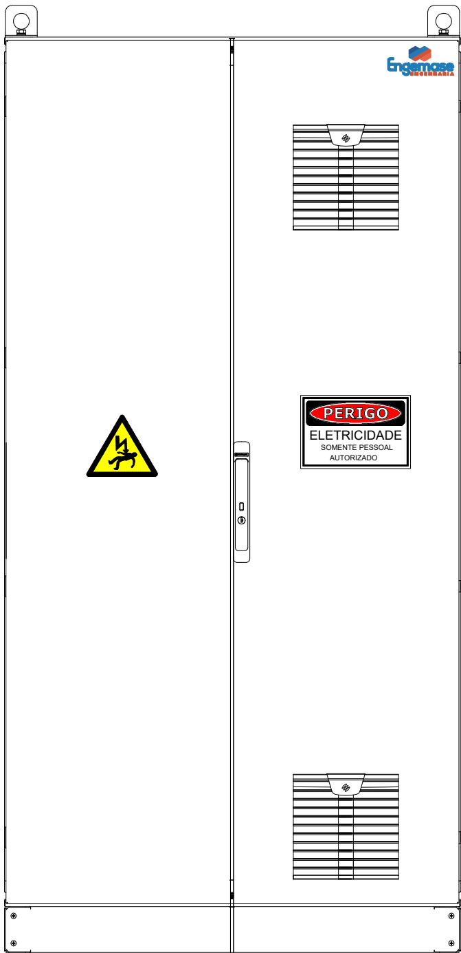
VISTA FRONTAL EXTERNA